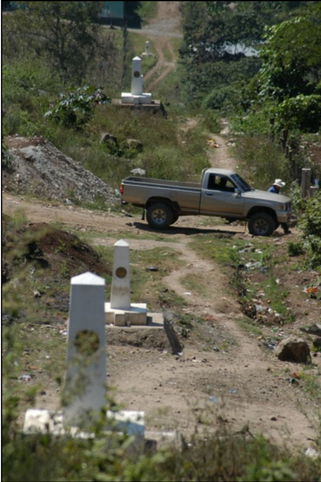
A porous land border between Guatemala and Mexico where illegal migrants bound of the U.S. frequently cross.