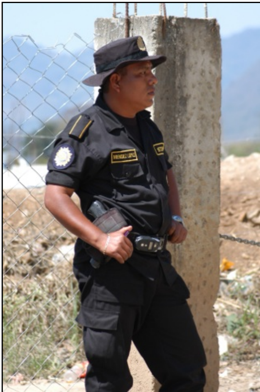
A federal customs agent of the Guatemala government on duty near the Mexican frontier.