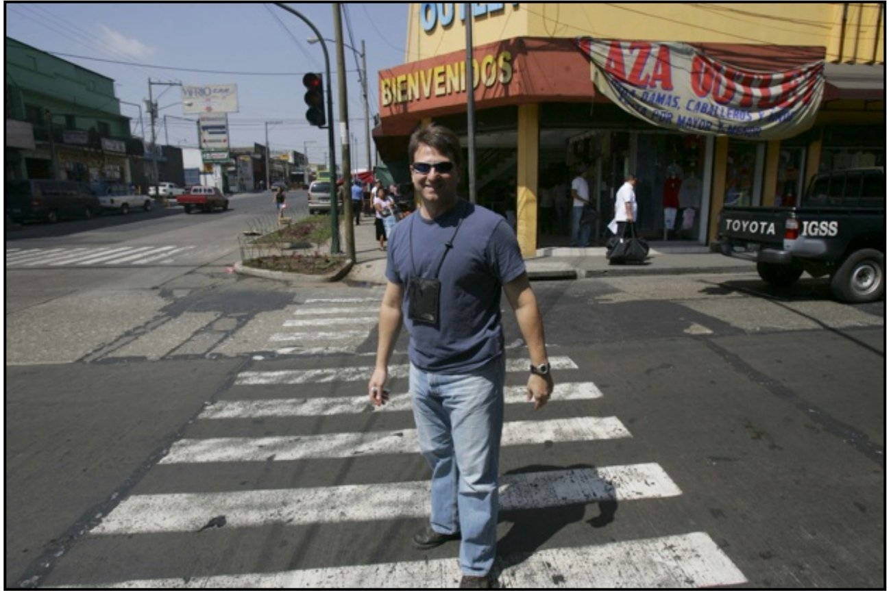
Bensman on a street corner in Zone One.

Within hours of boarding the bus, Boles would feel for the first time the heat of America's obsession with security.